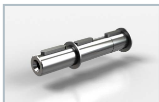
Single output shaft